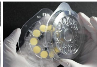
③Remove the lid properly. (Please do not drop the crystals)