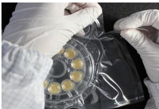
①Tear anywhere to remove it from the plastic bag