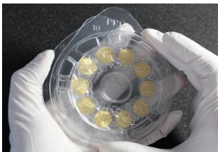
②Rotate the lid slightly to your left side.