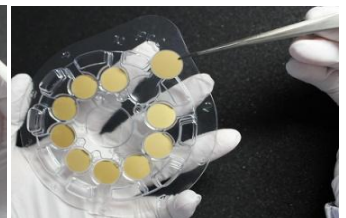
④Load the crystal into the holder

※Please Do Not Harm the Crystal Electrode When Handling!